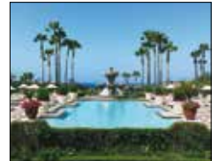
Miraval Resort & Spa, Tucson, Arizona: leisure attracts dollars for KSL Capital Partners