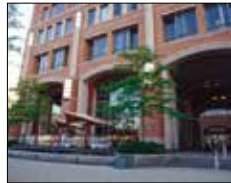
2 Seaport Lane, Boston: AEW's home

AEW does much more than value-added and opportunistic funds, of course, but it remains a significant force in the strategies nonetheless. Perhaps best known for its North American opportunistic series AEW Partners, the company has attracted almost $1 billion for that business in the last five years. On top of that there has been a value-added US senior housing fund that closed on $371 million last year and a southeast UK value-add office fund as well. It is currently said to be out raising an Asia value-add fund and a Europe value-add equivalent too.