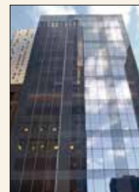
1140 Avenue of the Americas, New York: Almanac HQ

A totally new entrant to the PERE 50 this, but not a new firm. Almanac, created back in 1996, raises private funds to provide growth capital to public and private real estate companies. Since inception it has raised $3.7 billion for this strategy and it is still going strong. It is said to be in market with its latest offering for which it has so far garnered around $1 billion. That is added to the $819 million in November 2012 raised for the predecessor, Almanac Realty Securities VI. A Canada version was launched in 2014 as well. Upon the announcement of its most recent successful fund close, Almanac said Fund VI and its affiliates had made commitments to invest up to $150 million in Drawbridge Realty Trust; up to $150 million in NRES Holdings; and up to $100 million in RAIT Financial Trust.