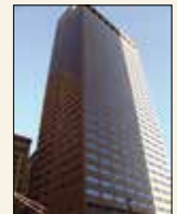
28 State Street, Boston: TA Realty might have changed hands but it remains firmly in the top ranking

Big corporate change has come to this organization, but for now, TA Realty remains in the PERE 50 on the back of two large funds closed in 2010 and 2013. In 2010, the Boston-based group collected $1.4 billion for its North American value-add fund, The Realty Associates Fund IX. For the follow-on, The Realty Associates Fund X, it raised slightly more upon final close in April 2013 with capital commitments of $1.56 billion. But the big news was to arrive in October 2014 when it emerged that Japanese group, The Rockefeller Group, was to take it over. It follows on from a 2010 transaction when The Rockefeller Group became a strategic investor alongside management in London-based Europa Capital by acquiring a majority stake. Since then, Europa has raised its first funds since new ownership and has broadened its activities with the establishment of an income strategies business – a positive sign for TA perhaps.