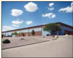
Indcor asset, El Paso, Texas: another big acquisition for GLP

Global Logistic Properties made an impressive debut in the top ten list in the 2014 PERE 50 rankings, and the Singapore-based logistics developer and fund manager has continued its stride this year as well, moving up the ranks to fourth. In September, the firm successfully completed a $2.5 billion fundraising program for China, a feat that has made GLP the biggest creator and investor in the logistics sector in the country. In just eight months, the firm managed to raise the capital from domestic state-owned companies, which include China Life Insurance Company and Bank of China Group. The firm