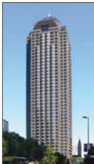
2001 Ross Avenue, Dallas: Invesco's HQ

Invesco is a serious player in the value-added and opportunistic space. The Dallas-based firm has amassed some $3.33 billion for these strategies with the single largest strategy being the Invesco Mortgage Recovery Fund for which it collected $1.465 billion by final close in March 2011. Do not let the name of the fund mislead you. It is a US opportunistic equity fund not a lending fund. The company also raised nearly $350 million for the Invesco Real Estate Value-Add Fund III in June 2013, plus a hotel fund in Europe. It is currently in the market with various value-added and opportunistic strategies, one a global effort, the other two for North America and Asia.