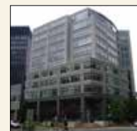
4445 Willard Avenue, Chevy Chase, Maryland: where JBG resides

The JBG Companies, which focuses on urban infill property in the Washington D.C. metropolitan area, ended fundraising for its Fund IX in August 2014. The $680 million raised has been partially put to use, with one of the latest transactions being the creation of a joint venture to invest in Washington D.C. with CBRE Global Investment Partners (GIP), the indirect real estate arm of CBRE Global Investors. Older funds with a 2007, 2010, and 2011 vintage were of similar sizes. Nothing has touched JBG Urban in 2007, however, which closed on $2.5 billion, though that one does not count for this ranking.