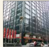
1633 Broadway, New York: Paramount's place of residence

Paramount Group is a real estate investment firm established that invests in office space in the US, with a focus on investments in New York, Washington D.C. and San Francisco. The firm launched its fund series in 2004 and raised $1 billion within two years for its first three funds. According to our data, the firm is in the midst of raising Paramount Group Real Estate Fund VII with a $400 million target. The fund sizes tend to be modest to mid-size. Fund VI raised $221 million in February 2013, for example.