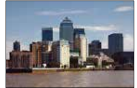
Canary Wharf, London: a signature deal for Brookfield

Brookfield Asset Management has been showing its ability once again to invest in big complex corporate situations, recently partnering Qatar Investment Authority to take over Canary Wharf Group in London's Docklands area. The Toronto and New York-headquartered company is also a player in the fundraising stakes, weighing in at number five this time around on the ranking. A large proportion of its overall $8.5 billion tally emanates from the $4.35 billion Brookfield Strategic Real Estate Partners (BSREP) fund, which was launched with a $3.5 billion target in 2012 and closed way above that in 2013. The strategy is to invest opportunistically and mainly in North America, Europe, Brazil and Australia. It is targeting positions of control or influence in direct properties, property companies, distressed loans and securities with a focus on multi-faceted distressed property turnarounds and recapitalizations. Other capital has been collected for a value-add multi-family fund directed at North American property and a Brazil retail property fund. Significant equity has also been raised as co-investment capital, further boosting the franchise.