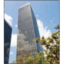
515 South Flower Street, Los Angeles: home to CBRE Global Investors

CBRE Global Investors, part of property services giant CBRE Group, is best known in the higher returning space for its US Value series. CBRE Strategic Partners US Value 6 was closed on $1.1 billion in 2012 lending one third of its total for the PERE 50 ranking. It is now said to be in market with the next fund in the series. In 2013, the Los Angeles-based franchise also secured $360 million for a US opportunistic development fund, CBRE Wood Partners Development Fund 3. The first and second versions were raised in the five-year time frame also. In addition, in 2014 the firm closed on $470 million for its second China focused fund, China Opportunity Fund II.