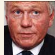
Grayken: trading places

Lone Star Funds slipped one spot to third place on the PERE 50 ranking, but that's only because it hadn't yet closed on its latest property fund, Lone Star Real Estate Fund (LSREF) IV, by the PERE 50 cut off date. Now that Lone Star has hit a final close and exceeded its $5.5 billion hard cap, the equity haul is likely to put the firm ahead of current second place finisher Starwood next year. Starwood Capital Group. LSREF IV was one of the three largest funds in the market at the beginning of 2015, along with The Blackstone Group's Blackstone Real Estate Partners VIII and Starwood's Starwood Distressed