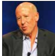
Sternlicht: generation X