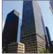
345 Park Avenue, New York: Blackstone's HQ is an equity magnet

Here's a statistic for you. In the past five years, The Blackstone Group has raised more equity for real estate investments than the entire GDP of 77 countries including Haiti, Zimbabwe, Senegal, Honduras, Nicaragua, Iceland and Jamaica. The latest fund has attracted capital commitments of $14.5 billion in less than four months and at press time was expecting another $1.3 billion from high-net-worth investors. Blackstone is also in the market with core funds, but that is not counted for the purposes of this ranking. There is no way any other firm will be ranked number one in this list for years unless Blackstone is taken over or indeed a small country decides to commit its entire GDP to someone else's blind-pool opportunistic real estate fund.