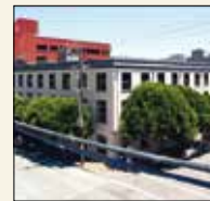
1000 Sansome Street, San Francisco: Carmel's home

Carmel Partners, the San Francisco-based firm, was a runner up in the PERE awards in the North America capital raise of the year category, but has not missed out on the PERE 50. The firm made the cut, in at number 49 after stunning success raising Carmel Partners Investment Fund V last year on $1 billion of capital commitments having spent just nine months on the fundraising trail. Many investors in Carmel's previous funds signed on for Fund V, along with several new limited partners that committed approximately $200 million of equity. The capital raised represented more than 50 commitments