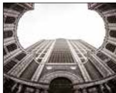
500 Boylston Street, Boston: Rockpoint's HQ

Further capital raising activity in the past few months has elevated Boston-based Rockpoint Group up to 12th position now. Its most recent fund is Rockpoint Real Estate Fund V for which it is targeting around $2.5 billion of equity and has raised nearly $1.5 billion as of press time. Rockpoint will pursue a similar strategy to that of Fund IV, focusing on value creation opportunities and resolving complex situations through the acquisition of primarily office, hotel and multifamily properties in the largest US coastal markets, according to the minutes from US pension New Mexico ERB's investment committee meeting last month. The figure combines for the purposes of the PERE 50 with equity raised in the predecessor funds and $377.8 million in new capital raised through RP NY CIP Investors, a co-investment partnership for the acquisition of 1345 Avenue of the Americas in New York.